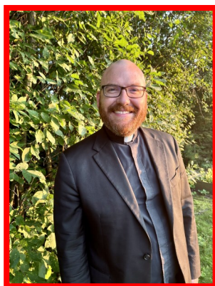
Student Council 2024-25

Student Council led a successful fund-raiser for the Lincoln County Humane Society last March. Through the Penny War the students and families contributed $1,517.08 for this worthy cause. The newly elected members are now planning ways to serve and witness this year.