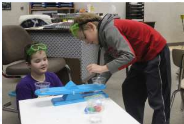
3rd Graders hard at work with a Science activity.