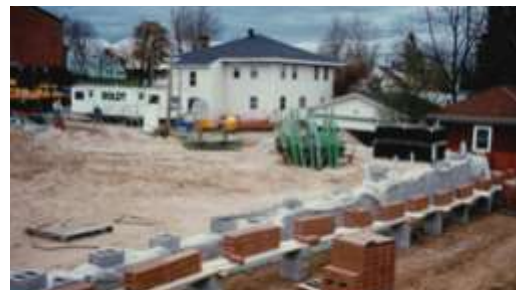
Construction of our current gymnasium. Old Methodist Chapel apartment building prior to demolition.