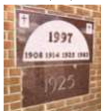
Original 1925 school building cornerstone. It was gifted to Trinity by the Marathon Granite Company.