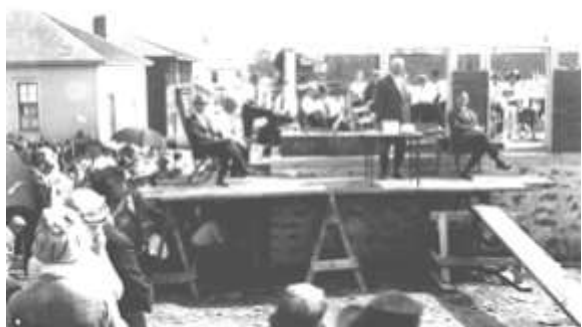
Laying of the cornerstone on July 12, 1925. Meyer's School and the Methodist Chapel in the background. Notice the children under the platform and the Trinity Band in the background "inside" the school.