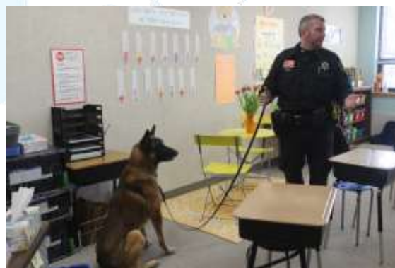
A visit from the WPD Canine unit.