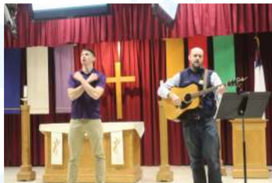
Chapel was lead by our friends from Camp Luther.