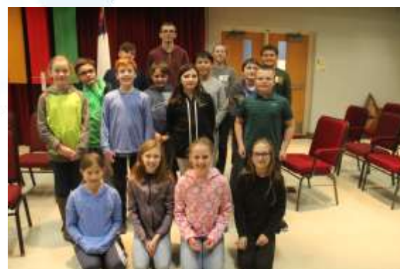
Geography Bee Finalists