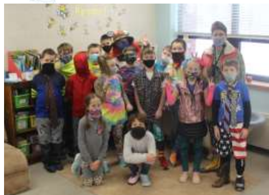
Dress Up Days