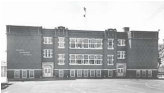
School building constructed in 1925.