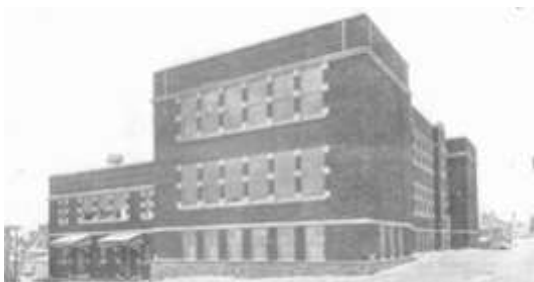
The building as it appeared in 1925 with available space above the gymnasium for a future addition.

Did you know...Following the construction of the 1925 school building enrollment continued to grow. By 1948 enrollment had climbed to over 350 students and lack of classroom space began to be an issue. When the building was built in 1925 only four classrooms were needed, but they provided for six. Thanks again to the farsightedness of the original building committee; it was possible to erect an addition above the gymnasium. To make plans for future growth heavy steel over the gymnasium ceiling was used in case a second story was ever needed. At the time it seemed like a wasted effort, but how well they built in 1925! The Oppenhamer and Obel firm again served as architects and Mr. Edmund E. Schield was chosen as general contractor. The new addition was dedicated on June 5, 1949 and provided three more classrooms, a library and other utility rooms, with a total of nine excellent classrooms in the entire building. ...now you know!