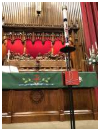
Notice the Paschal Candle stand with the Chi Rho symbol on three sides of the base.

Did you know...In the 70's a new Paschal Candle stand was purchased and placed in the chancel. Above and below the cross is Alpha and Omega, the first and last letters of the Greek alphabet. These symbolize that Christ is the same yesterday, today, and forever. The numerals of the current year are between the arms of the cross to signify that the risen Christ shall be a "pillar of fire" also in this year to lead us to the heavenly Promised Land. Finally, in the center and in each end of the cross, wax nails are affixed to symbolize the 5 wounds of Christ (head, hands, feet and side). On the stand itself is the Chi Rho symbol which stands for the first three letters of Christos or Christ. The Greek letter chi (ch) is written as the English capital letter X. The letter rho is like the English letter capital letter P. The new candle for the church year is lit on Easter Sunday and every Sunday following until the Feast of the Ascension. You will see the Paschal Candle placed and lit by the font for baptisms to signify the beginning of a life in faith. The Paschal Candle is also placed and lit at the head of the casket during funerals as a reminder that death has no victory over a baptized child of God...now you know!