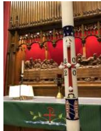
Five wax nails are affixed to the Paschal Candle to symbolize the five wounds of Christ (head, hands, feet and side).