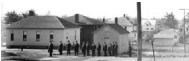
Groundbreaking on May 24, 1925. Meyer's School and the Methodist Chapel in the background along 5th Avenue.