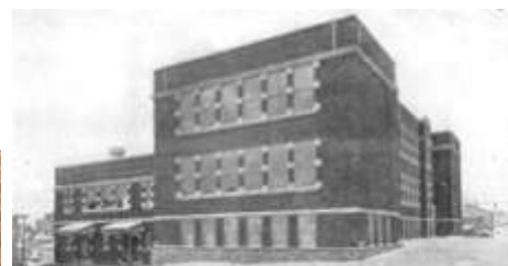
Completed 1925 School looking west. The shorter portion of the building to the south was the gymnasium auditorium.