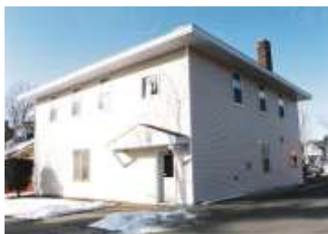
Remodeled into an apartment building.