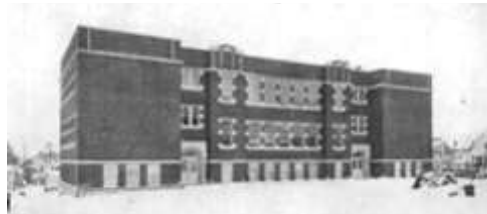
Completed 1925 School looking south-west. Cornerstone located on the north-east corner of the building.