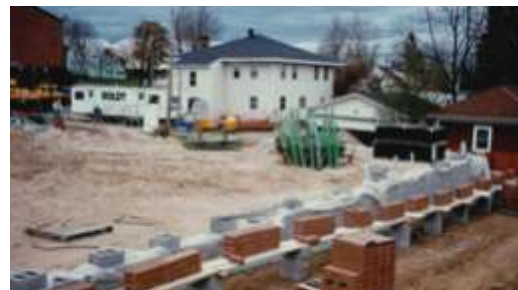
Construction of our current gymnasium. Old Methodist Chapel apartment building prior to demolition.