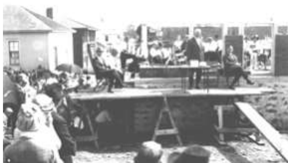
Laying of the cornerstone on July 12, 1925. Meyer's School and the Methodist Chapel in the background. Notice the children under the platform and the Trinity Band in the background "inside" the school.