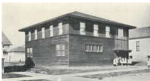
Notice the school children and Meyer's School on the right.

Did you know...School enrollment continued to grow, and already in 1922, just seven short years after the construction of and expanding the school into Meyer's School, there was need for more classroom space. There was a Methodist chapel next door and to the south of Meyer's School, and it was decided to rent the building for $25 per month. The third and fourth grade students were moved into the building, and the school occupied the chapel until the construction of a new school building in 1925. The Methodist Chapel was eventually converted into apartments and then in 1996 was purchased by Trinity and later demolished with the expansion of our current school building in 1997. ...now you know!