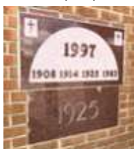
Original 1925 school building cornerstone. It was gifted to Trinity by the Marathon Granite Company.