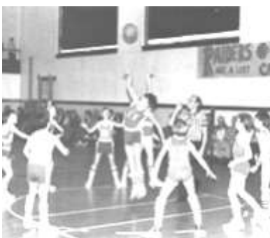
Boy's basketball game in the early 1980's. If you look close in the upper left hand of the picture you can see someone in the balcony.

Boy's basketball game in the early 1980's. Notice the people sitting on the stage watching the game.