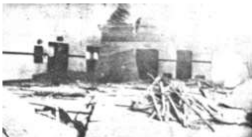
The only picture we have of the aftermath of the ceiling collapse. Although the picture is blurry you can still see the piles of rubble.

Did you know...On Wednesday, August 18, 1937 Trinity experienced their heaviest property loss in our history. At about 11:00 in the morning the ceiling of the auditorium/gymnasium came crashing down with a deafening roar. Falling large sheets of plaster, weighing many tons, crushed fifty wooden folding chairs to splinters, breaking portions of the grand piano and piercing the hard maple wood floor in places. Equipped with a balcony and stage, on several occasions the room had been occupied by six hundred or more people, but by the grace of God no life was lost and no one sustained any injuries. The ceilings of the schoolrooms were reinforced immediately, so that no similar accident might occur. ...now you know!