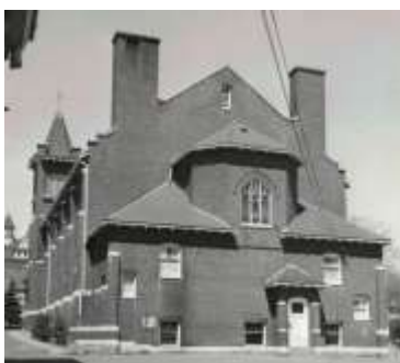
How the south end of the church appeared prior to the 1958 addition. This picture was taken the day before construction began.