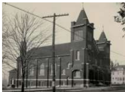
How the exterior of the church appeared prior to the 1958 addition. Notice the parsonage on the right side of the picture.