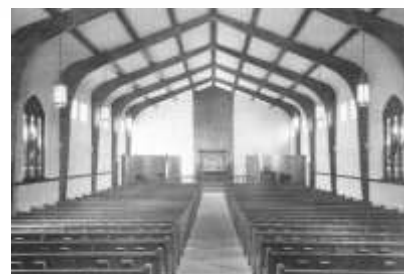
How the chancel and nave appeared following the completion of the 1958 addition. Notice that the large wall cross has not been installed yet. That would be added later along with scrolling on the chancel screens to match the pulpit, lectern and font. Eventually the altar would be enlarged to fit the larger chancel area.