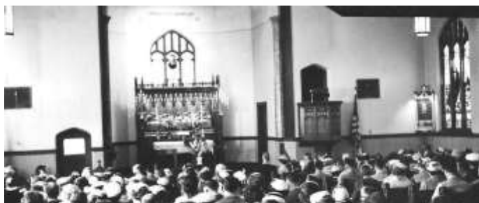
How the chancel appeared prior to the 1958 addition. The altar, pulpit, font and lectern were purchased by the Ladies' Aid Society and installed in 1924 along with the altar carving of The Last Supper. All these still remain today, although the altar, lectern and pulpit were slightly modified to fit within the 1958 addition.