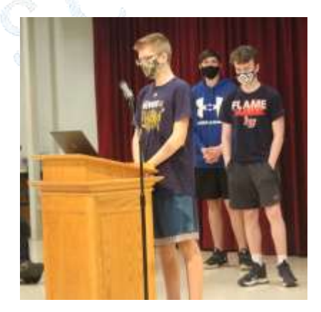
8th grade leads chapel