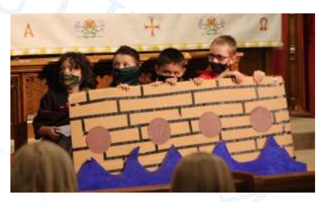
Second Grade Chapel on Jonah