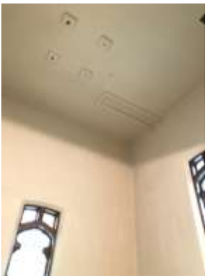
The ceiling of the east belfry as it looks today. You can still see the openings where the bell ropes once were.