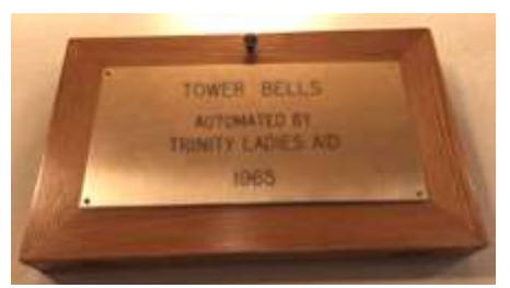
The inscription on the control box cover.