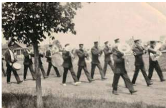
The Trinity Church Band seen marching sometime between 1910 and 1915.