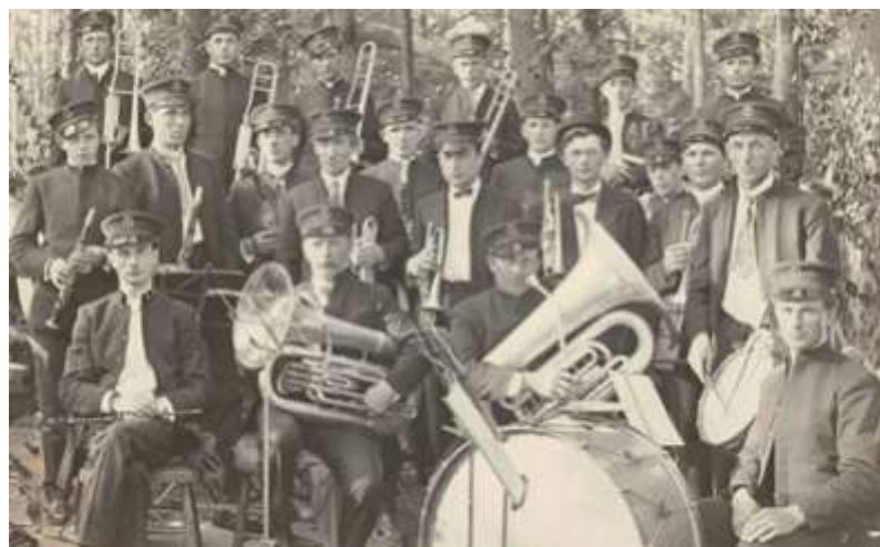
A group picture of the Trinity Church Band in 1913.