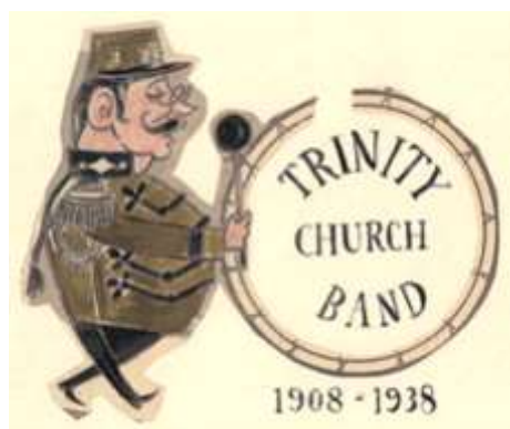
The Trinity Church Band was officially organized in March of 1909 and continued until January 1938.